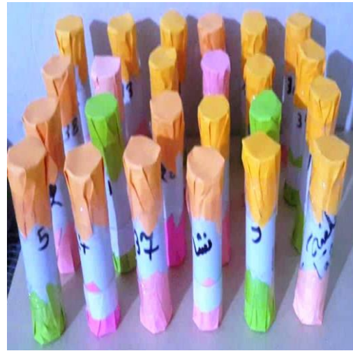
Figure 1. Sealed can technique.